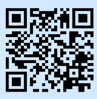
Scan this QR code or visit <a href="https://bit.ly/3QZfQvH">https://bit.ly/3QZfQvH</a> to learn more, and receive a free demo.