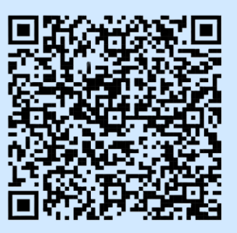
Scan to download the full report.