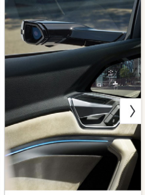
Visión perfecta con Audi virtua

"What makes LinkedIn so fascinating for Audi is the audience. The user persona perfectly matches the kind of people we want to reach. We can talk about innovation, technology and other important values of the brand to a premium audience, and within a premium environment."