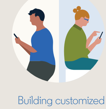
audiences with your contact lists