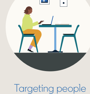
who've visited your website

Matched Audiences on LinkedIn provides unique targeting capabilities that help you reach people who already have a relationship with your brand. It lets you combine LinkedIn's professional data with your business data by: