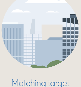
companies against 50 million company pages on LinkedIn