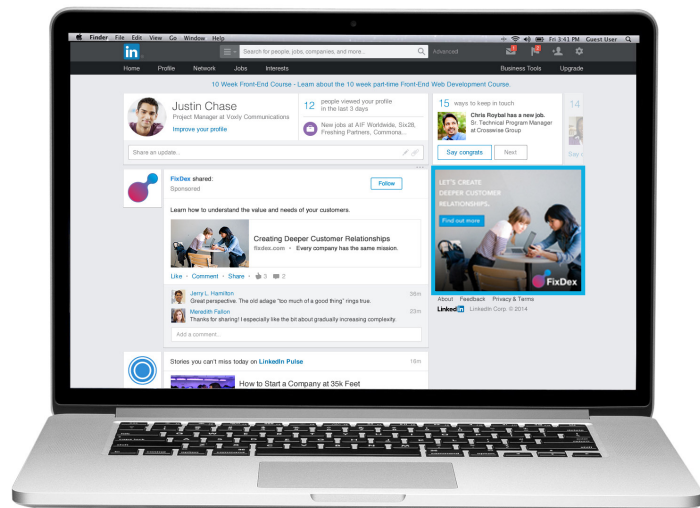
Deploy IAB standard display ad unit formats served on the right column of the desktop.