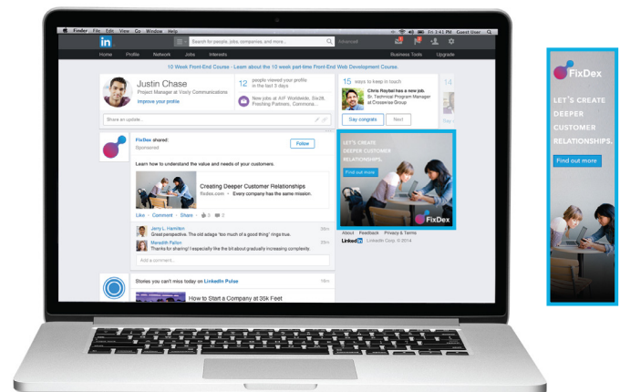
Programmatically purchase LinkedIn Display Ads in 300x250 and 160x600 IAB standard formats served on the right column of the desktop version of LinkedIn.com."