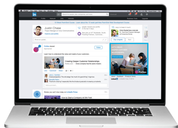
Programmatically purchase 300x250 IAB standard display ad formats served on the right column of the desktop version of LinkedIn.com