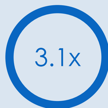
More likely to accept an InMail when candidates engaged with Eaton's Employer Brand on LinkedIn